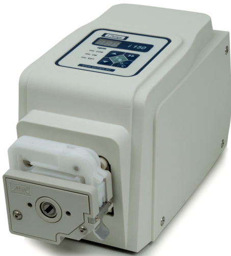
i150 with B2 R10 two Channel Pump Head

The i150 pump has been designed and manufactured to a high standard to give long and reliable operation. Delivering flow rates from 0.006 to 360 ml/min, and the ability to adjust the speed manually using the membrane keypad, or automatically using the iPumps software or through an external control interface, the i150 offers a unique combination of precision, performance and price.