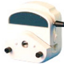
C1 R3 Single Channel Pump Head